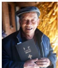
The cover photo shows a senior man with a Bible in China.

Whether a present or stocking filler, giving the Greatest Gift will allow you to give the gift of the Bible to someone around the world. If you wish, we can send you a card to pass on to your loved one to represent your gift.